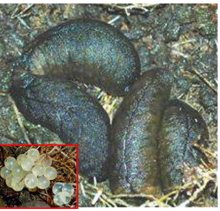
Leaf-vein slugs & eggs