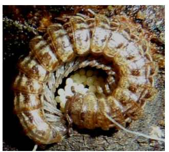
Millipede (with eggs)